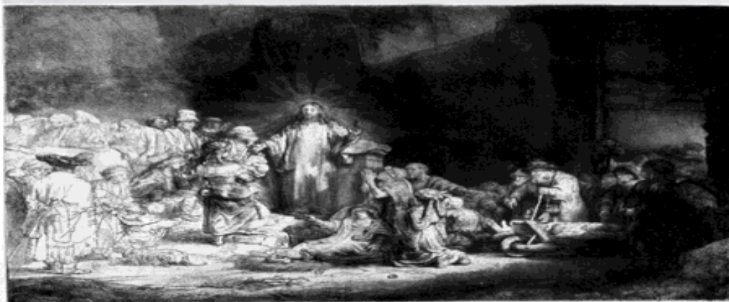
Christ Healing the Sick", by Rembrandt (c. 1646-1650).

Now when John heard in prison about the things the Christ was doing, he sent word by his disciples to Jesus, asking, "Are you the one who is to come, or should we look for another?" Jesus responded, "Go, report to John what you hear and see. Those who were blind are able to see. Those who were crippled are walking. People with skin diseases are cleansed. Those who were deaf now hear. Those who were dead are raised up. The poor have good news proclaimed to them. Happy are those who don't stumble and fall because of me." (Matthew 11: 2-6)