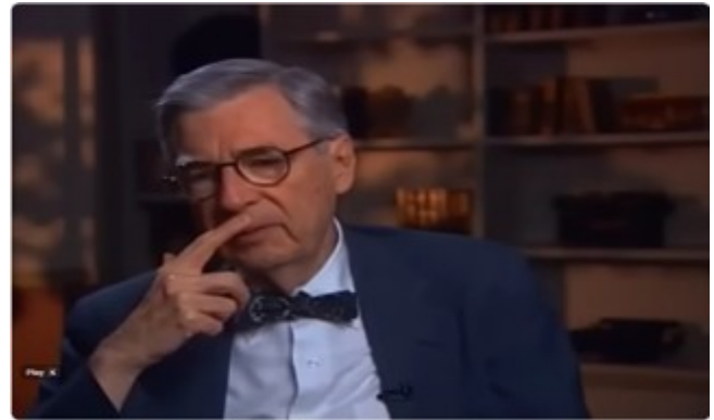
Fred Rogers: Look for the Helpers

Thus, I return to the notion of being present – now. If we, like John the Baptist, are disappointed in how God is showing up in the world perhaps we, like him, need to reconsider what Christ’s Reign is and how we live into it.