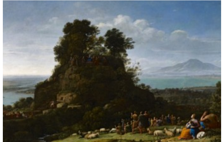
Sermon on The Mount - Claude Lorrain

An accurate English translation for us to individually and collectively use is by offering impartial and just acts that are pleasing to God. In simpler terms – we should strive to be worthy, act fairly, and offer impartial love.